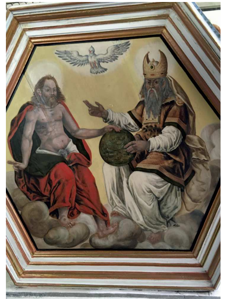
Sounding board above the pulpit in Nicolai's Church in Geithain