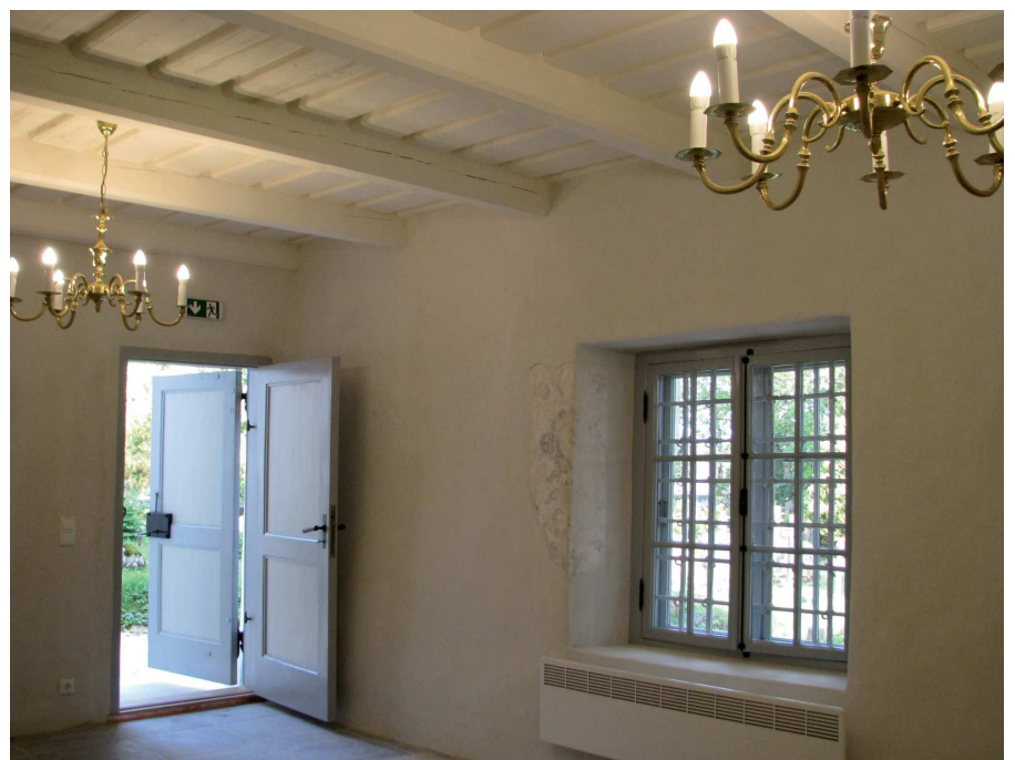
View of the winter church