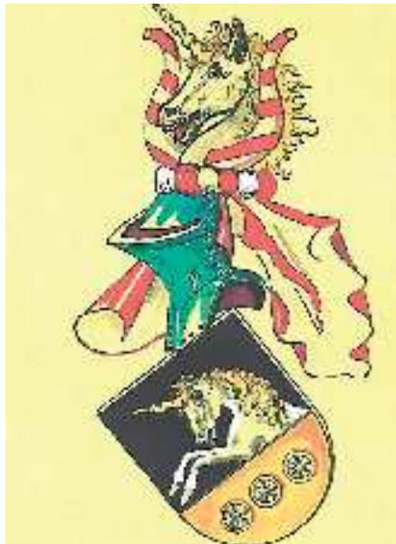
Wappen Schilling Günzburg