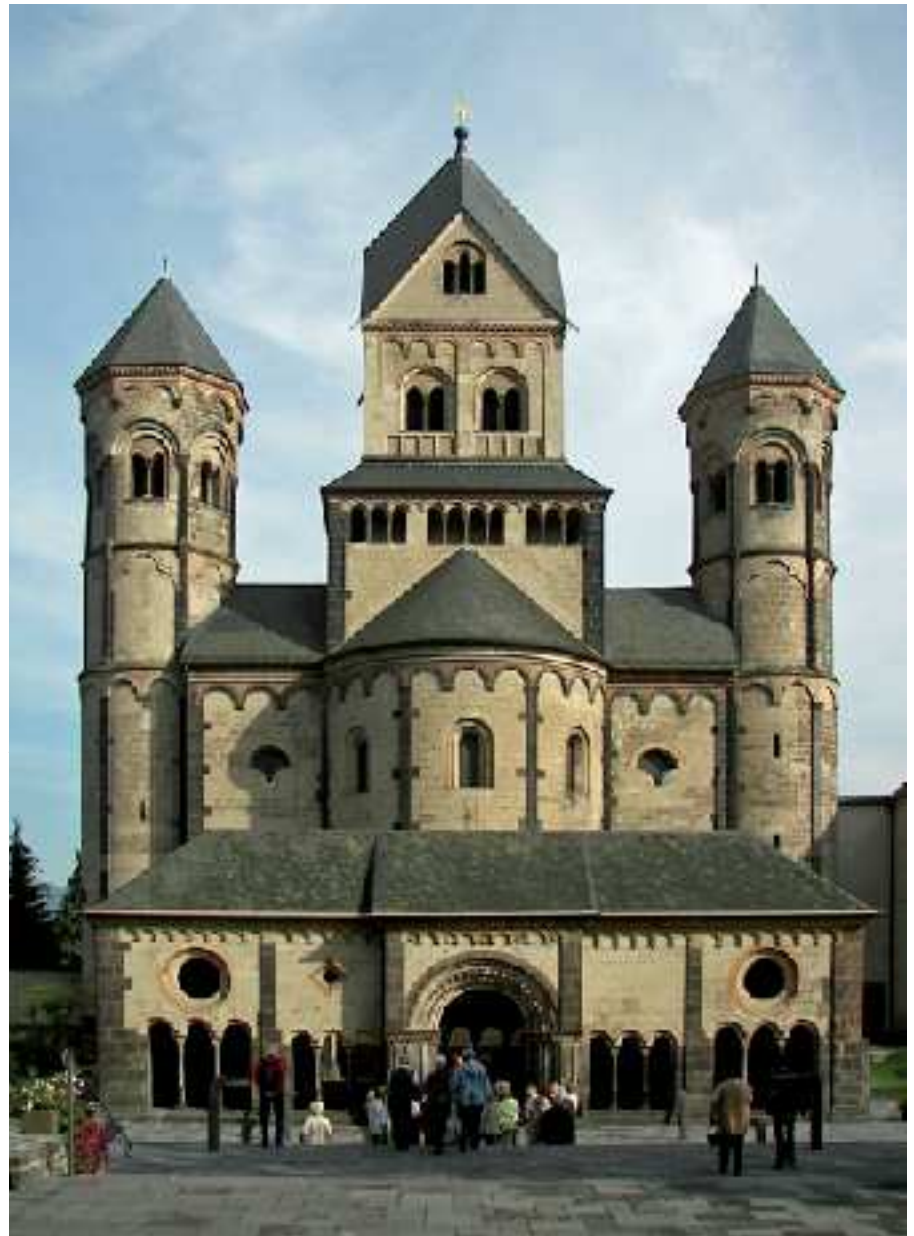
Maria Laach Abbey