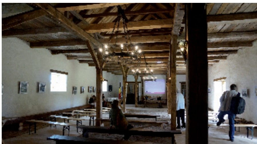
The restored granary on the opening day

In appreciation for fighting against the Soviets in the Estonian Liberation War (1918-1920) part of the estate was granted to an Estonian by the government. After the Soviet occupation in 1940 he was expelled, too. When Estonia had regained independence in 1991, however, the family of his granddaughter was given the estate back. The granddaughter attended the celebration,