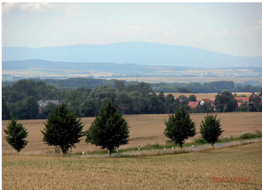
View of the field “Unter dem Schilling” in the Magdeburg Börde with the Brocken, the highest mountain in the Harz, in the background.