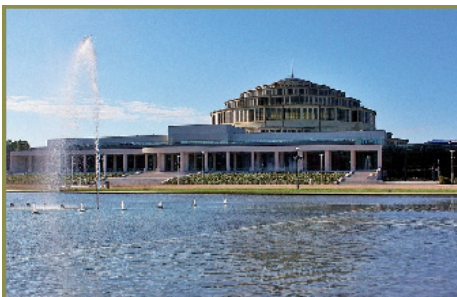
The monumental Centennial Hall, built in 1924