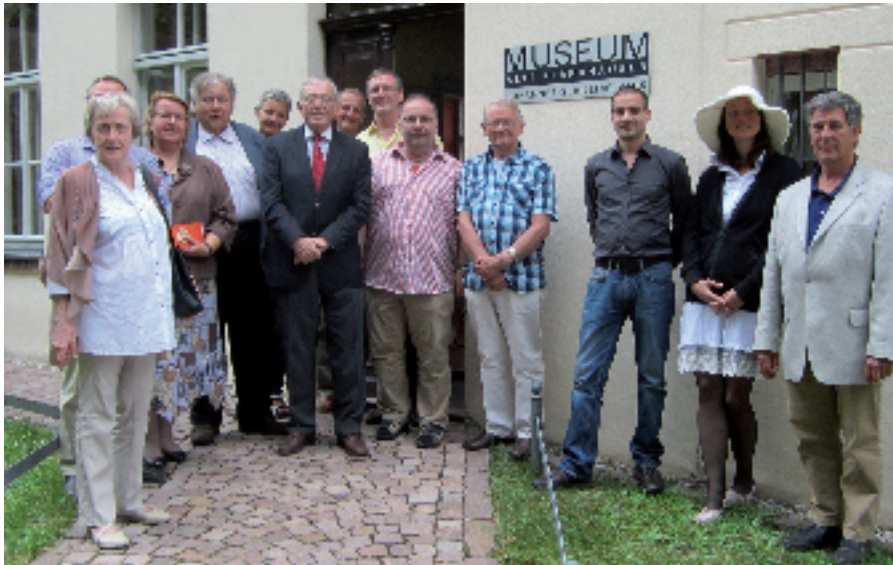
Members of the western branch in front of the Schilling-Museum

Western branch met to celebrate his 185th anniversary