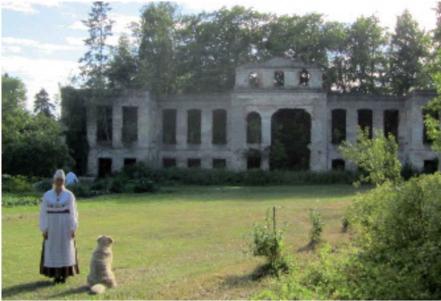
The ruined manor house of Paddas with its new owner