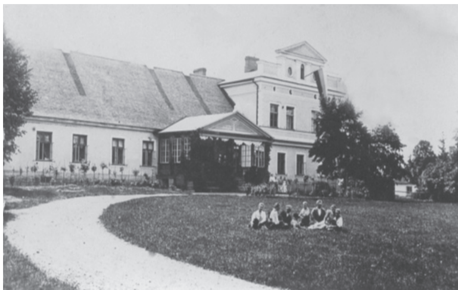
Seinigal Manor, ca. 1900. The manor house was destroyed by Soviet soldiers before the German invasion in 1941. Today there are only ruins left.

The oldest find, a simple stone axe from the Stone Age (8000 – 1800 BC), came from Kahal Village. The numerous stone settings (barrows composed out of stones of different size) are testimonies of the Bronze Age (1800 – 500 BC). During the