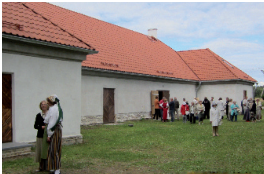
The restored granary on the opening day