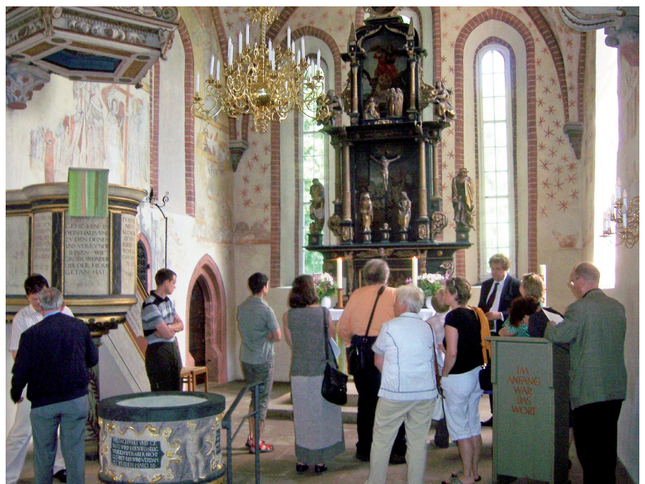
In the sanctuary of the refurbished Trinitatis Church in Meissen-