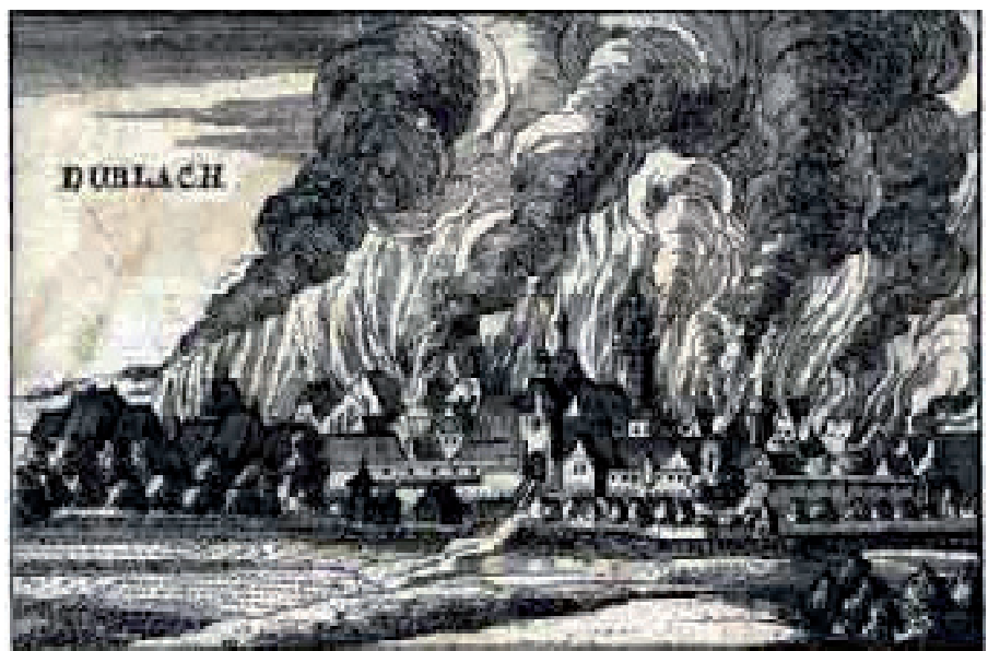
The burning of Durlach in 1689