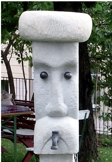
Work of art created by the Sculptors' Symposium