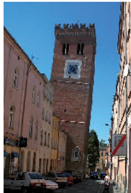
The „Lesning Tower“ in Frankenstein, 15 th century

On the next day our tourism programme will start with a bus trip