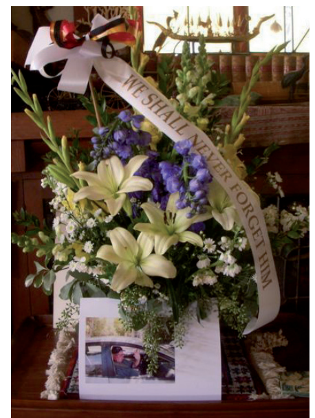
The bouquet of flowers given by the family association