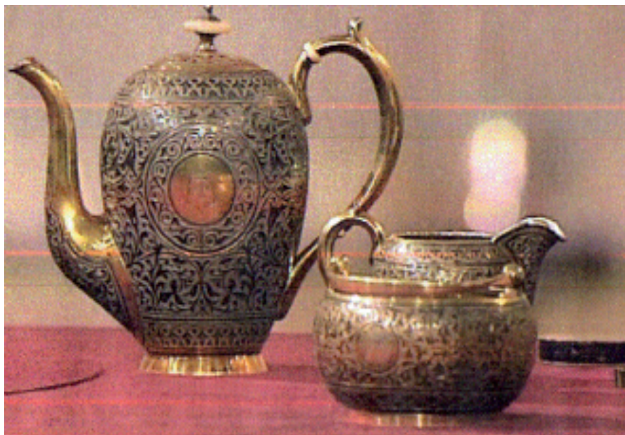
The silver tea set

A new family member discovered in a TV show