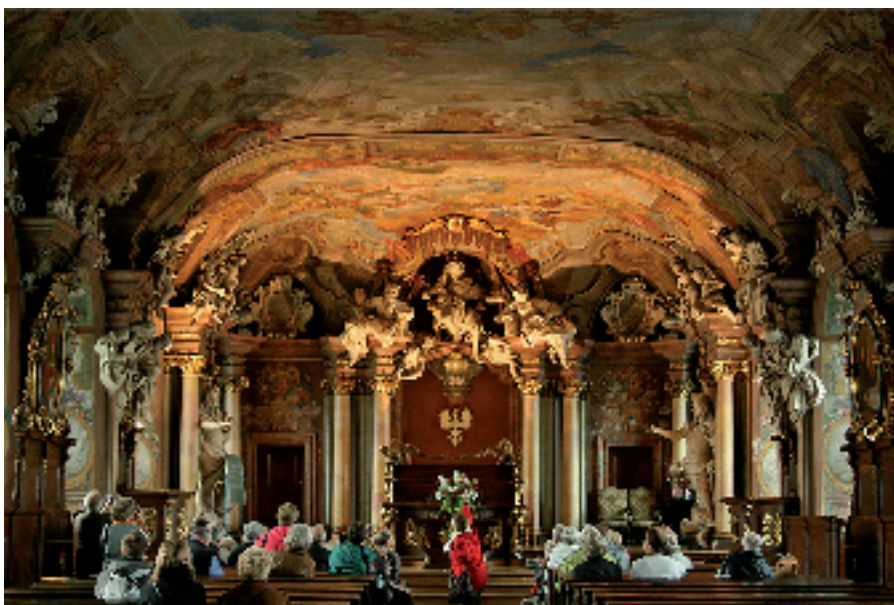
The beautiful "Aula" of the University of Breslau