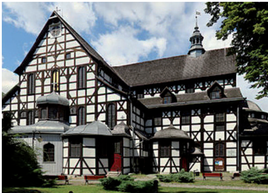
The oldest wooden church in Europe, the Church of Peace in Schweidnitz/Świdnica, built from 1656-1657

In the evening there will be a festive dinner at the „Royal Restaurant“ on the Rynek. On the next day we will hold our members meeting and select the members of the board. Later we will visit Schweidnitz/Świdnica with the Church of Peace, the oldest wooden church in Europe, and Kreisau/ Krzyżowa.