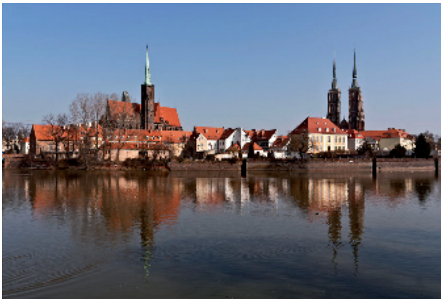
View of the Cathedral Island; right: the Cathedral; left: St. Martin's Church

In the afternoon busses will take us to the Municipal Museum in the former royal castle. In the museum there is a brass plate in memory of Councillor Gottfried Schilling (1547-1603). He was one of the donors when the roof of St. Elisabeth's Church needed to be replaced. Passing by the university (established in 1702) we will arrive at the Cathedral Island, the oldest part of Breslau. Sacral buildings and the magnificent Cathedral of John the Baptist, built between the 12th and the 14th century, as well as the Bishop's Palace, characterise the unique atmosphere of this island.