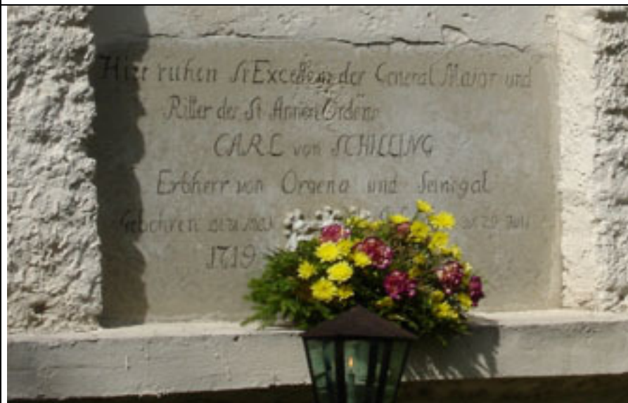
Flowers decorating the epitaph of Karl Gebhard.

61 people toured the country on the occasion of the family reunion in July 2006