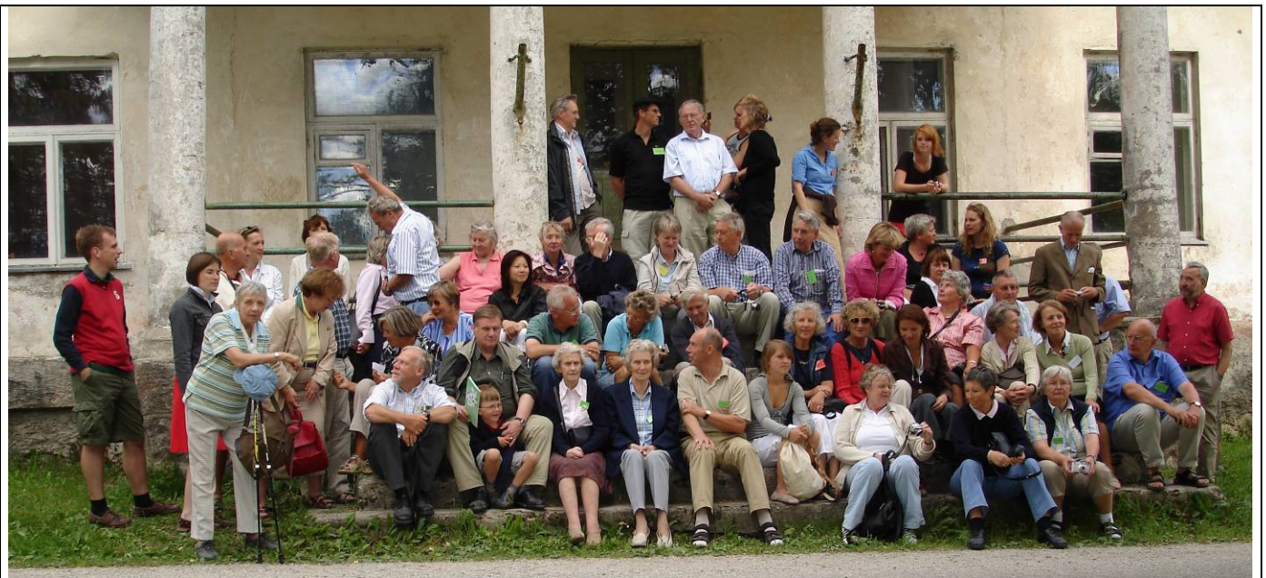
Members of the Baltic branch in front of the manor house of Orgena, the original seat of this branch.

in finding any resemblance. The first highlight of the reunion was a dinner in the “Olai Hall”, one of the big rooms of the “Schwarzenhaeupter” guildhall. The tables were nicely decorated with flowers and candles, the food was delicious and we all drank a lot. Afterwards most of the family eventually met on the market square, where they continued celebrating until late into the night.