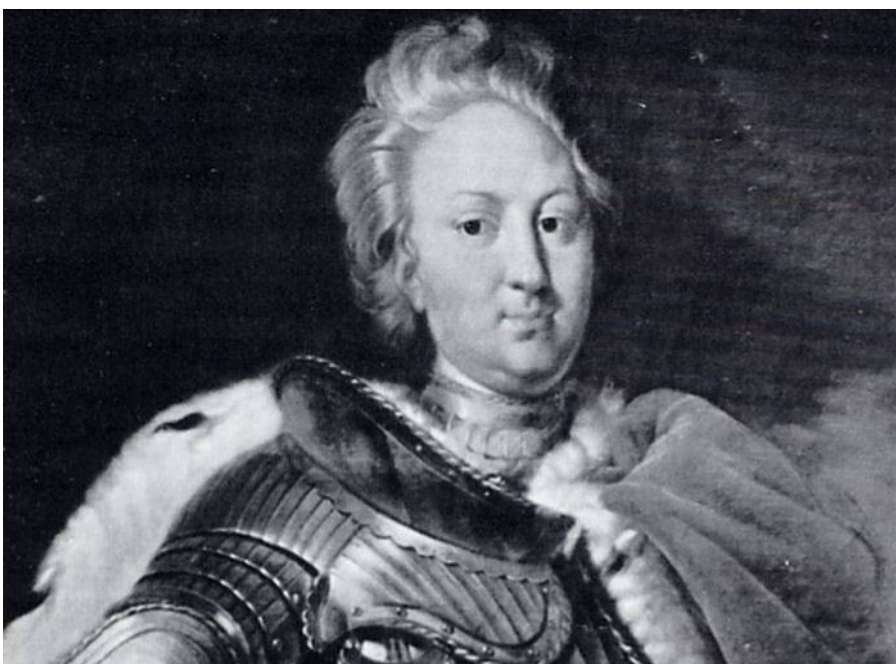
The Markgraf Karl Wilhelm of Baden-Durlach.