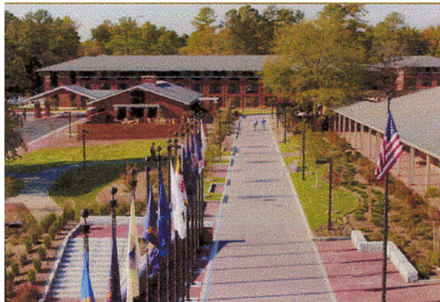
The Colonial Williamsburg Hotels are situated in the historic area.