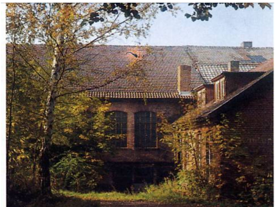
The old forge of the Schillings in Suhl, Thuringia. It was built in the year 1897.

Schillings will always keep up the tradition of their forge.