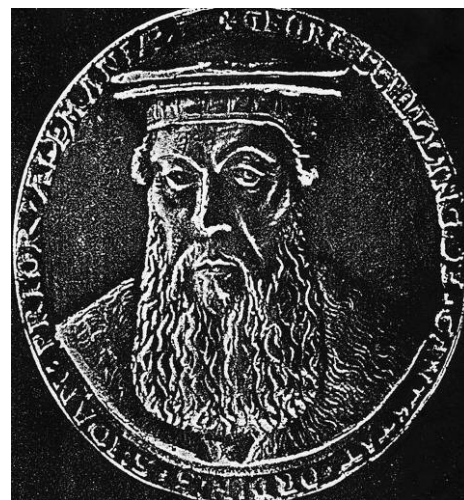
Georg Freiherr Schilling v. Canstatt on a contemporary medal.

Paul became Councillor of State at the court of the Tsar. In Russia he is regarded as the country's most important inventor. In 1832 he invented the first electromagnetic needle telegraph, (later Morse Telegraph). His working model, placed in the University of Heidelberg, however, was stolen by a Mr. Cook from England, who eventually obtained a patent on this invention. The US American Samuel Morse stole this clever idea as well and had it registered by his name in America. We ought to realize that we actually use the "Schilling code" and not the "Morse code". Paul also invented the first watertight cable (1812) and successfully presented it in St. Petersburg, Bonn, London and Paris.