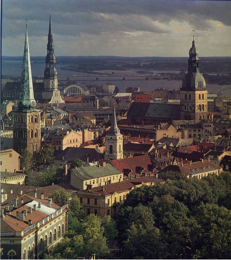
Riga, the capital of Latvia today

water. The caretaker extinguished the fire in the curtains with a shovel of snow.